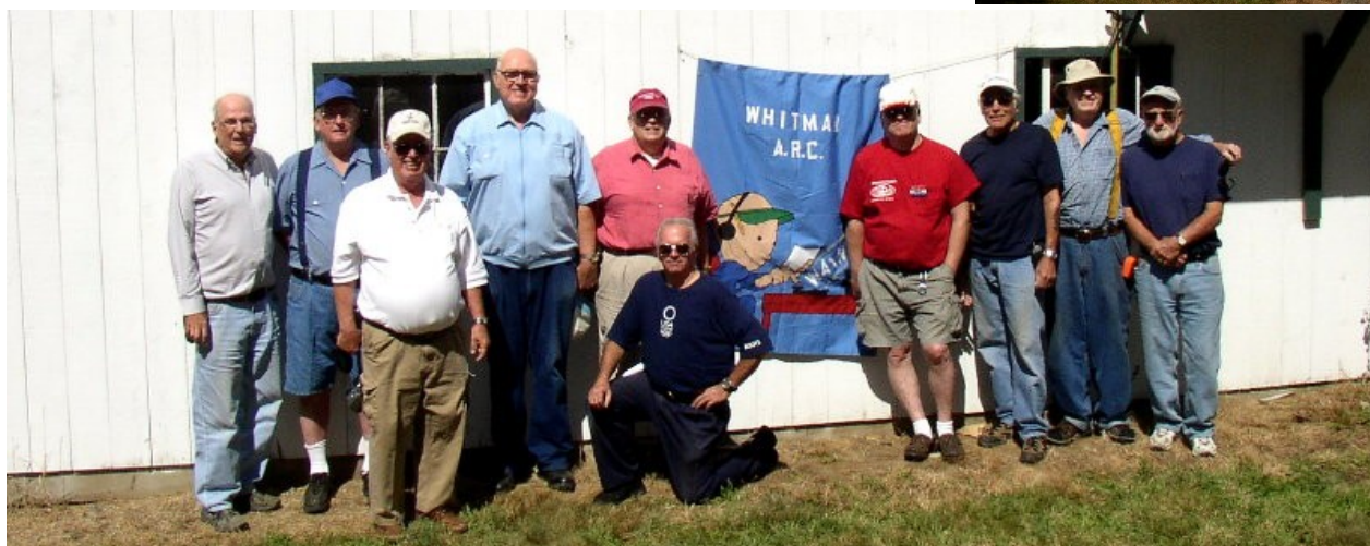
The Marshfield Fair Antenna Crew